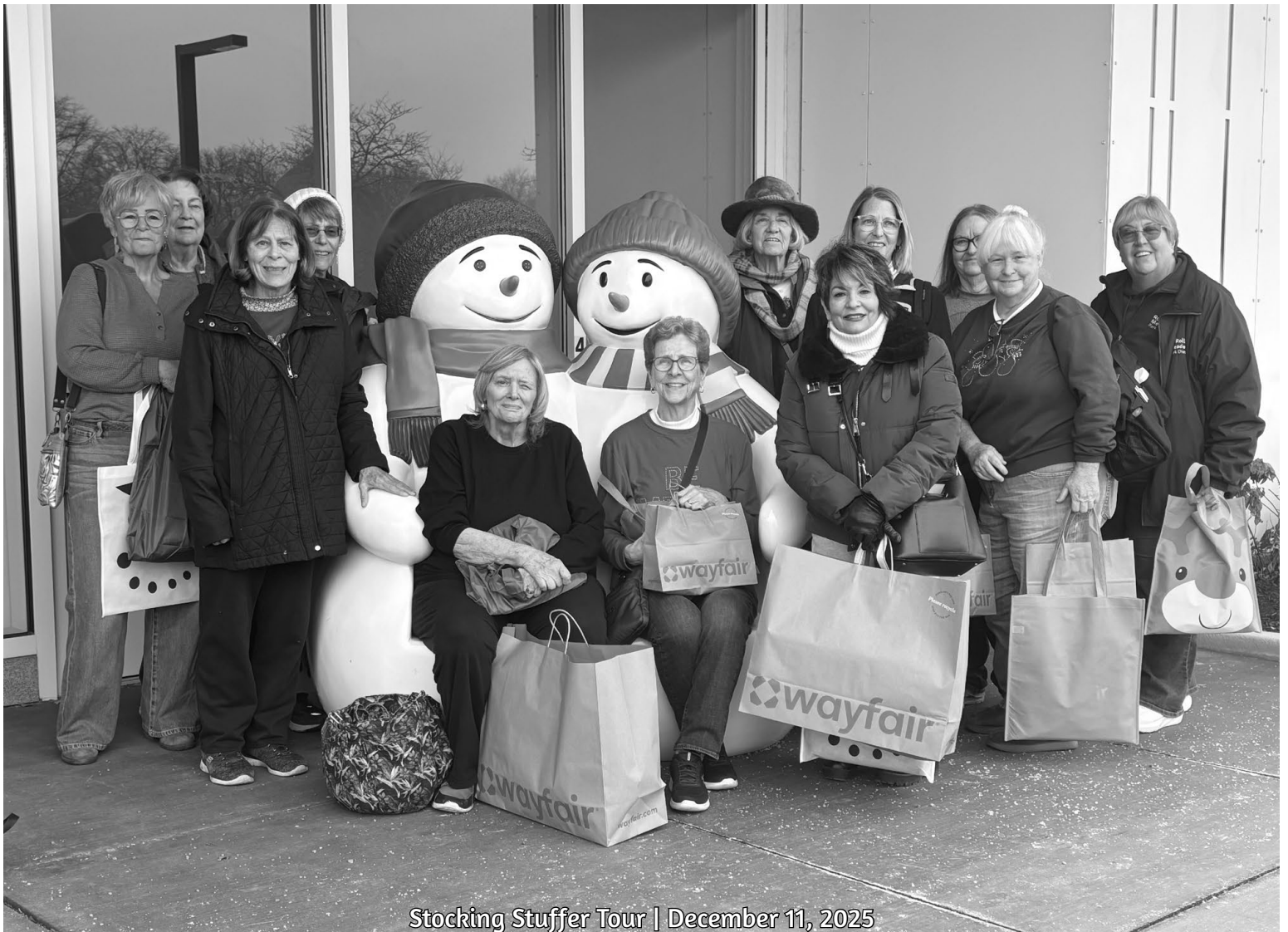
Stocking Stuffer Tour | December 11, 2025