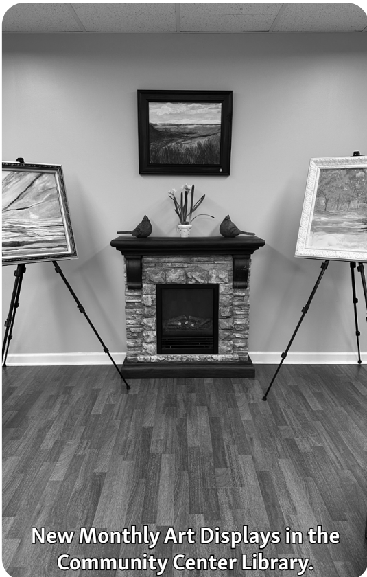
New Monthly Art Displays in the Community Center Library.

ROLLING MEADOWS PARK DISTRICT ADULT ACTIVITY CENTER | 3705 PHEASANT DR. | 847-818-3200 | RMPARKS.ORG